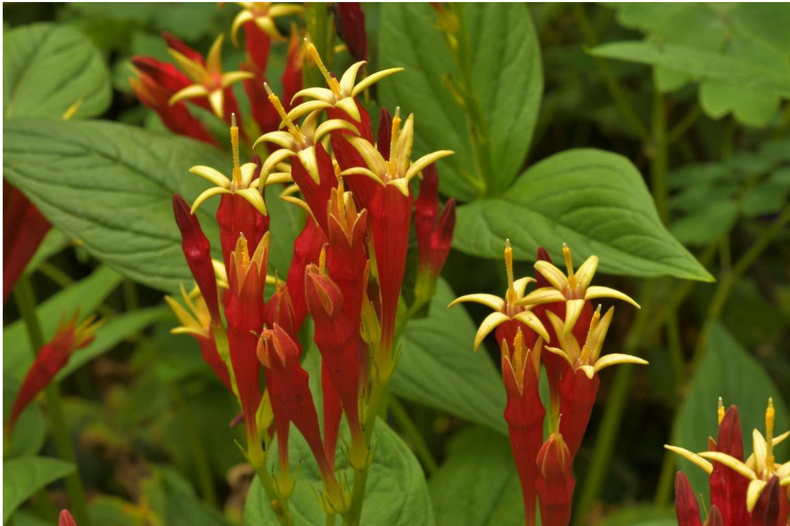
Spigelia marilandica – Indian Pink