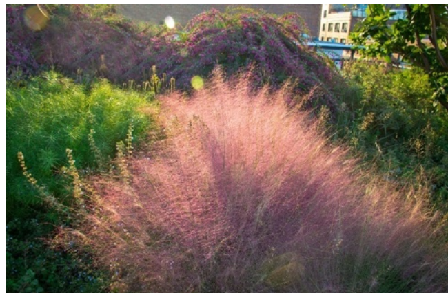
Leonard J. Buck Garden in Far Hills