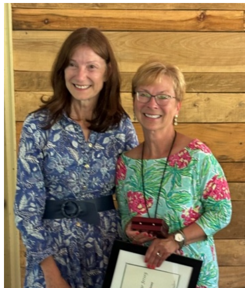
Medal of The Garden Club of New Jersey