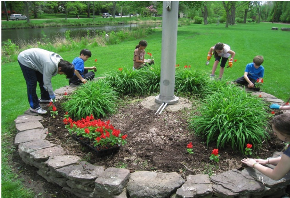
Demarest Garden Club hosts its Annual 5 th Grade Planting Day