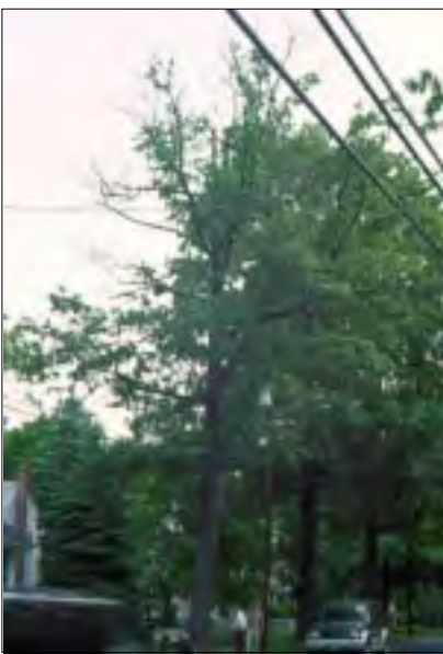
Photo 6. A mature oak infected over several years with BLS showing numerous dead branches.

Currently, there is no known direct cure for BLS . Injecting diseased trees with antibiotics reduces symptom development but cannot eliminate the pathogen, and injections are expensive and must be repeated. Tree life, however, may be extended by improving general tree health. It is recommended that soils where young, smaller-diameter oaks are growing be tested for pH and nutrients and amended accordingly. Irrigation and pruning needs also should be monitored regularly. Urban oaks need to be surveyed yearly to determine early BLS infection when symptoms are limited to one or two branches. These branches can be