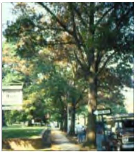
Photo 4. Numerous main branches with BLS leaf symptoms on a tree infected more than two years.