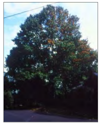
Photo 3. First and second year BLS infection where only one or two main branches show leaf symptoms.