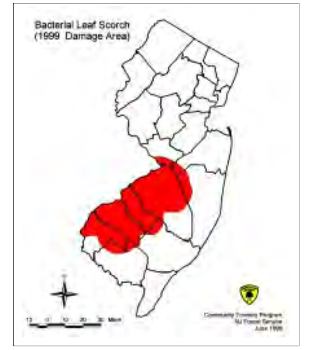
Colored area depicts where high concentrations of BLS have been reported in oak.

X. fastidiosa is transmitted to healthy trees by leafhopper and spittlebugs and possibly other xylem feeding insects. These insects acquire the bacteria when they feed on infected trees and possibly other hosts. Many common herbaceous plants such as goldenrod, blackberry, alfalfa, clover, and some grasses, frequented by these insects, also may serve as reservoirs for X. fastidiosa .